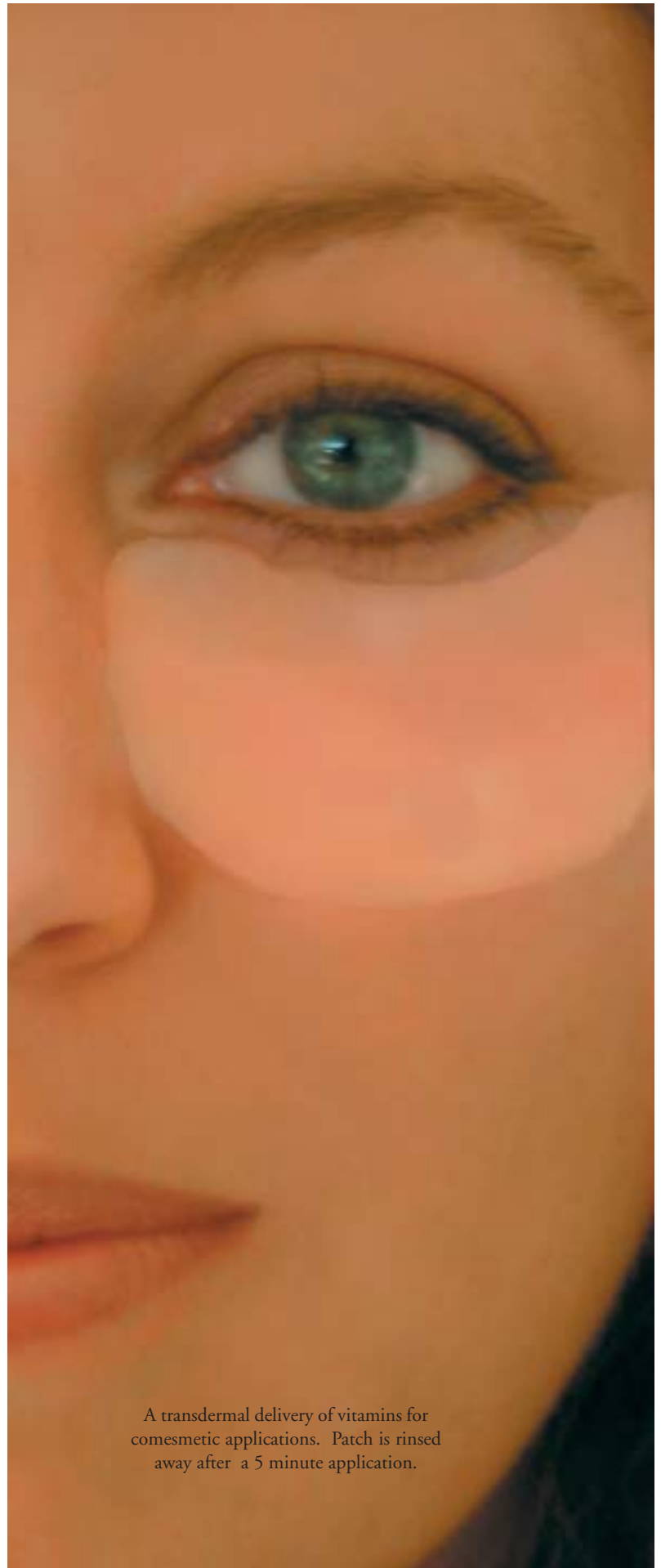
A transdermal delivery of vitamins for cosmetic applications. Patch is rinsed away after a 5 minute application.